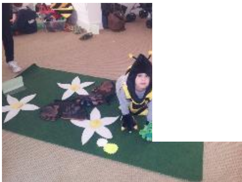
Pretending to be.....a bee. A young visitor to Fun in the Fields.

“It was informative and fun. The children loved the practical hands-on stuff, especially the printing activity.”