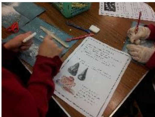
Wallisdean Junior School recording flints

On 12 February the Community Engagement and Learning Officer (CELO) did an outreach session at Wallisdean Junior, working with Year 3 & 4 on the museum they were setting up for their families as a culmination of their prehistory topic which began with 4 workshops in the museum in January. The learning they undertook at Westbury Manor was clearly reflected in the activities they devised for their own school museum.