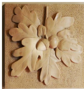
Piece by Fareham Woodcarvers.