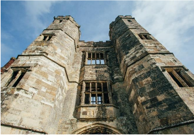
Titchfield Abbey, which features in the Royal Blood exhibition

Part of the Hampshire Cultural Trust's Big Theme 2016 on Royal Blood, 'Heads and Tails' focusses on the past 2000 years of English Royalty through objects, interactives. It features a special Royal Blood horrible history trail for families. Visitors can delve deeper into their local history at this Westbury Manor Museum exhibition, through a special focus on the Tudor period, the English Civil War in the reign of Charles I and the remarkable Wriothesleys. Supporters of Henry VIII, patrons of Shakespeare, at odds with Elizabeth and friends of King Charles I, the Wriothesley family lies at rest in Titchfield Church.