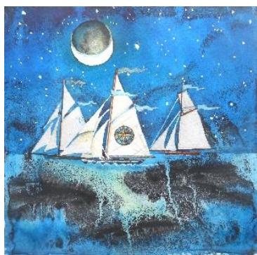
Artwork by Solent Art Society